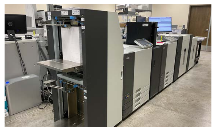
Our newest press is capable of printing 6 million pages of beautiful color curriculum each year.

Thank you to supporters who gave generously to this facility, making the expanded Africa outreach possible. Pray that all the materials shipped will bear much fruit for God's kingdom!