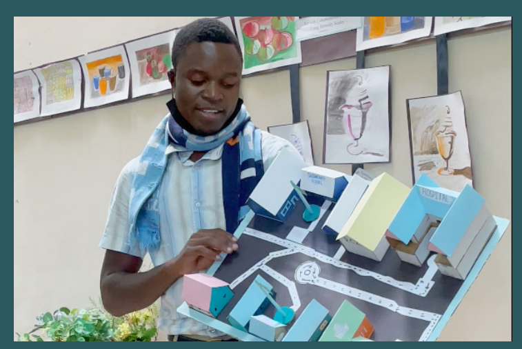
This RICE student is presenting the story of his life through symbols on a Lukasa board, Rafiki Village Zambia.

All training is tuition free for students who now number in the hundreds. Join us by supporting the training of a teacher through the Where Most Needed fund.