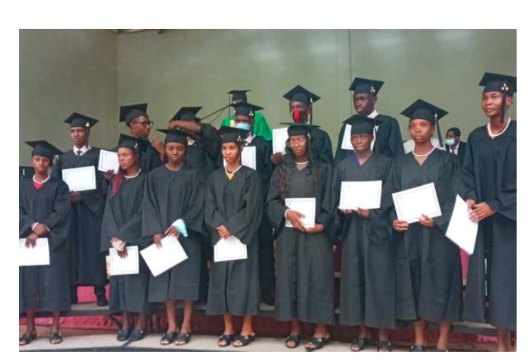
In Zambia 21 young adults recently graduated. Many of these students are in college continuing their studies.

Individual guidance to the best post-secondary path for their gifts and callings is essential. This year we have 168 young people enrolled in some type of tertiary study. These grads are studying auto mechanics, nursing, computers, catering, chemistry, geography, law, medicine and surgery, furniture craft, hospitality, economics, physiotherapy, and more. Thank you, sponsors, for your long-term support of our Rafiki Scholars, and we thank God for faithful and loving missionaries and national staff that continue to disciple them as they move on to independence.