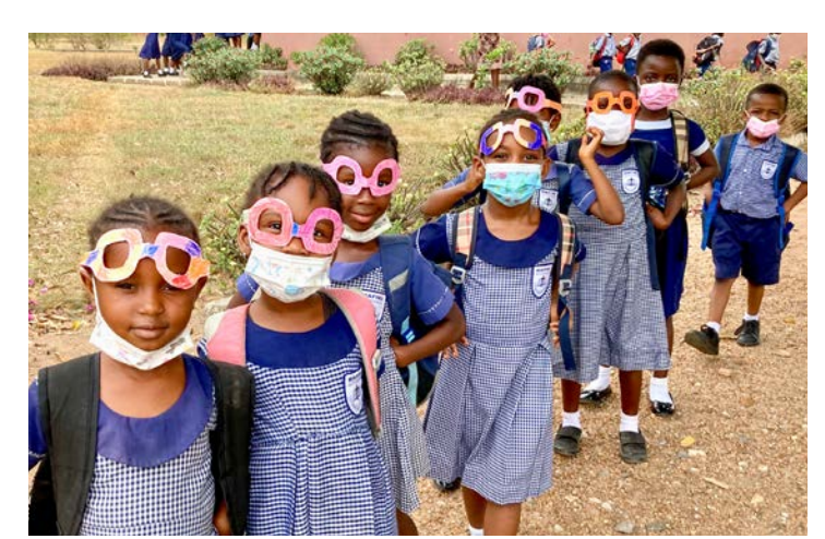
A line of preschoolers after a day learning about their eyes, Rafiki Village Ghana.