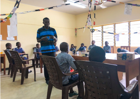
RICE student hosting a book celebration for 4th-6th grade