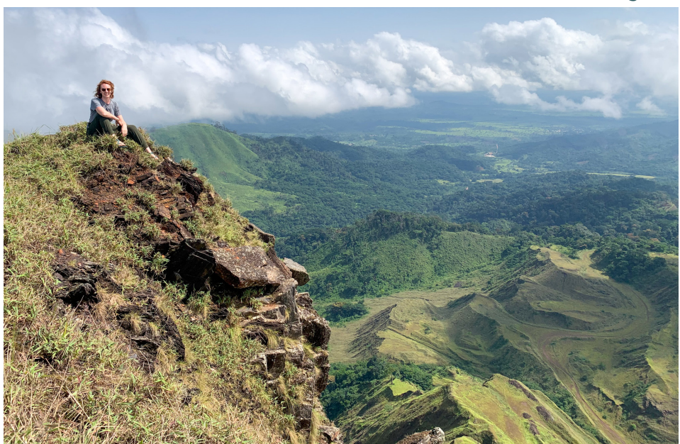
Recent weekend trip to hike Mount Nimba with friends

Thank you so much for your faithful prayers and support!