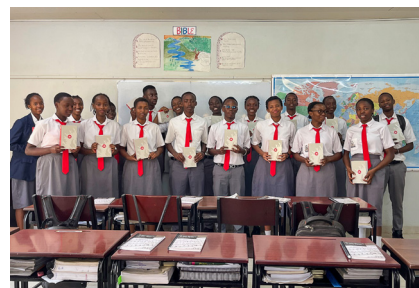
Our tenth graders receiving new classroom study Bibles. I also teach these students Theology once a week.

Contrastingly, I have been helping the Rafiki students in Rwanda consider personal virtue more deeply. I know there are several lists of virtues depending on the source, but few people would argue against building character traits in young people such as hope, diligence, humility, and respect. Just yesterday I received a note from one of our high school students. In it she wrote, "You encourage us to study hard and respect our elders. You have taught me... to be a godly young woman in Christ." I can testify that she is a sweet, hard-working student who is pursuing virtue both in and out of school. And she is not the only one. Many students are making intentional changes in their lives to reflect what the Bible teaches about character. Simple things, such as greeting teachers on the sidewalk or honesty in schoolwork, really add up. Isn't that truly what pursuing godliness is all about?