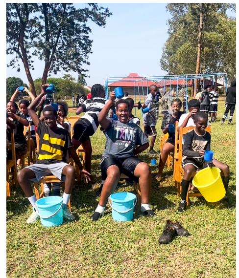
Junior high students enjoying a water game during Field Day in October.