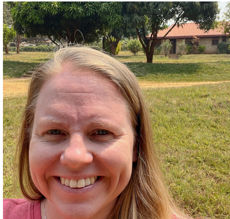
My new home in Rwanda.