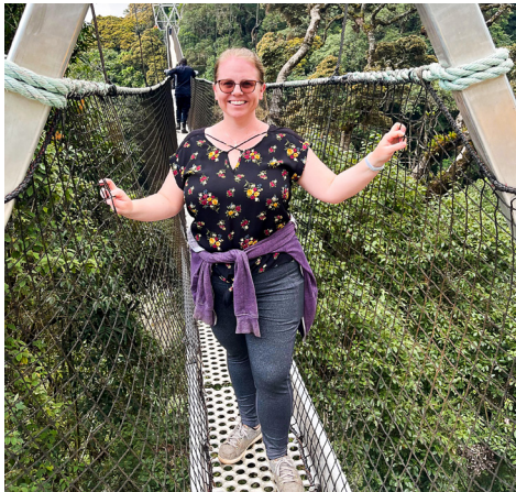
Enjoying the view at Nyungwe National Park in the southwest part of the country.

answering! I am also glad that my job is so much more than discipline issues and paperwork. In fact, a huge portion of my week is devoted to being in classrooms, observing teachers, and coaching them to become better educators with their own set of virtues. Truly, the heart of the Christian teacher is discipling students to deeper love and obedience to Jesus, which is what I am trying to cultivate in my teachers here.