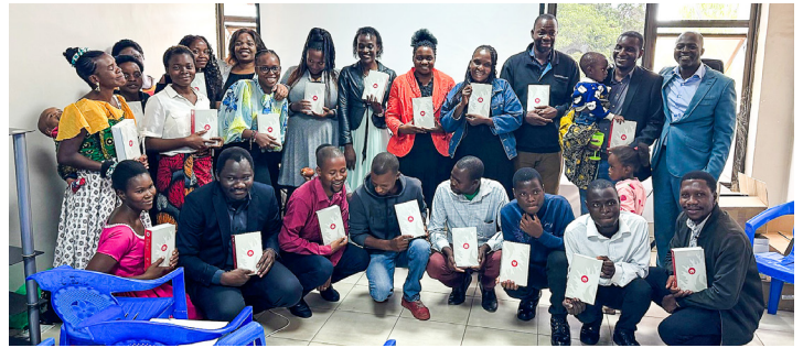
Christlike Bible distribution