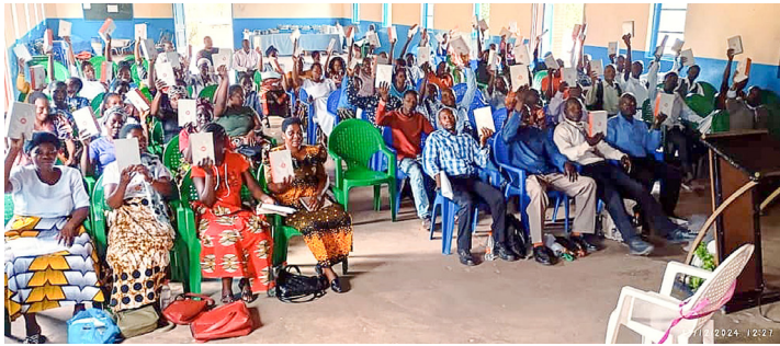
Mzimba Bible distribution