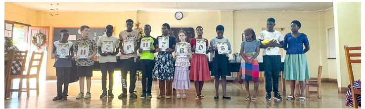
Grad night drama