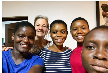
Rafiki girls in Ghana