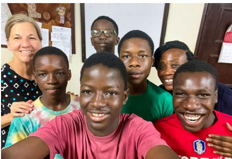
Rafiki boys and their Cottage Mother in Ghana