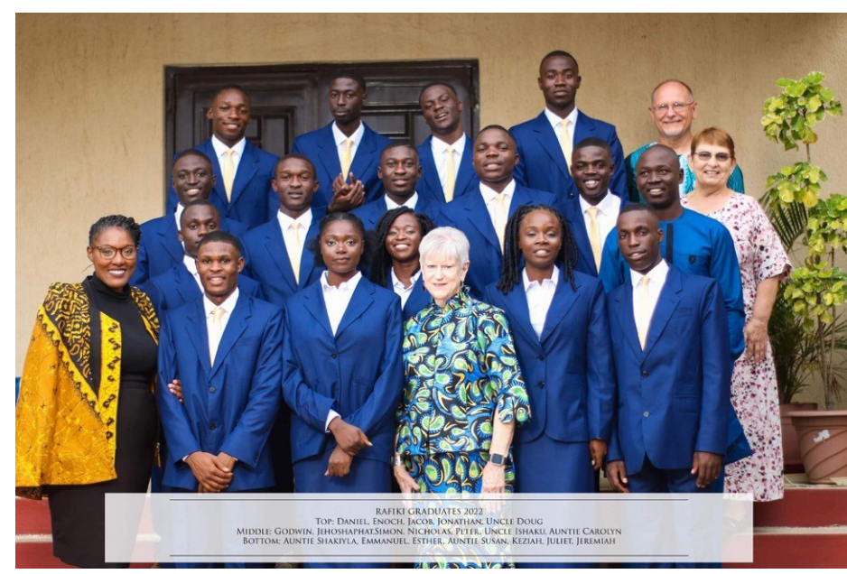
2022 Rafiki graduates along with our Rafiki Village Nigeria team

We thought you would enjoy reading some news from Rafiki's recent Facebook posts. See how God is working in the Rafiki Village Nigeria below! We celebrated another round of graduates from the Rafiki School in Nigeria! They all passed their national exams and are back with their families waiting for universities to reopen. This year marked our biggest ceremony thus far with over 500 attendees who came to support our students!