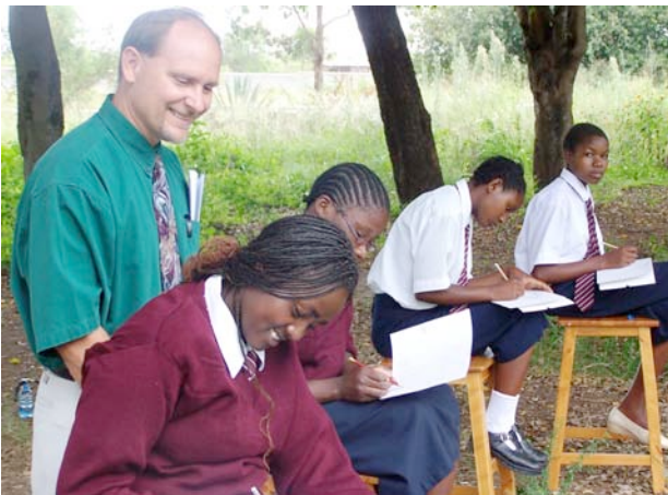
JUNIOR SECONDARY SCHOOL