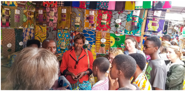
Our students negotiating the best prices at the market