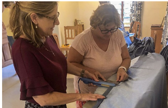
New use for a hair straightener

near their California homes. Four of the six missionaries' families had to evacuate their homes while they served here.