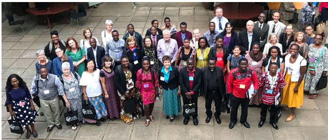
Rafiki Educators, Missionaries, and Home Office Team

What a wonderful gift to give our children!