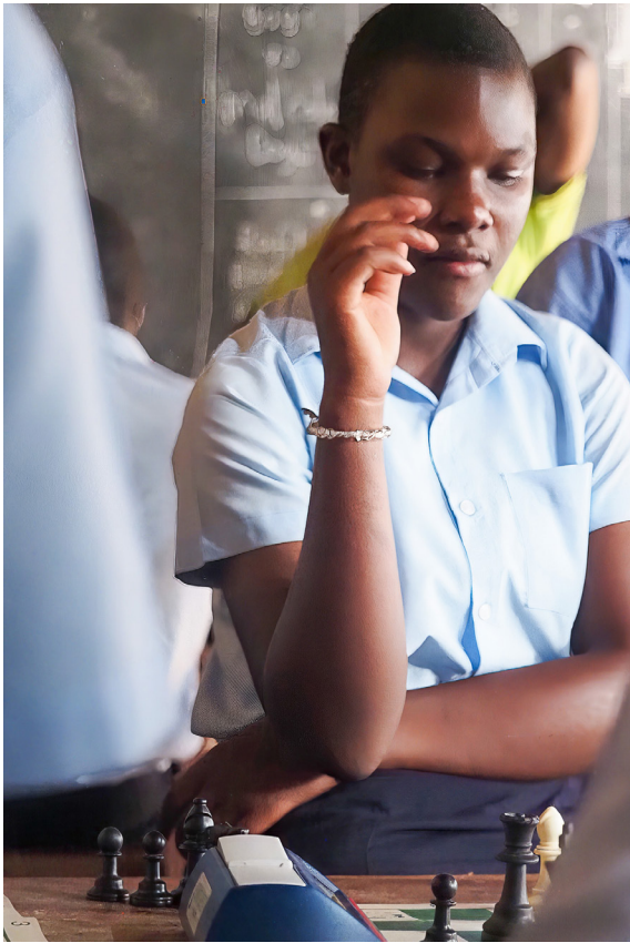
Rafiki chess players had a successful season including a medalist and a top five finish at Nationals 1