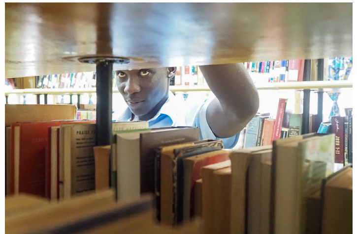
S2 student uses the Secondary Library