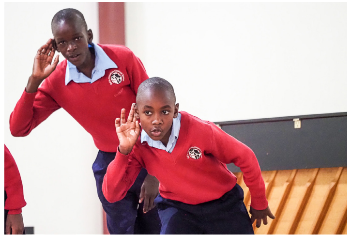
GL5 students listening for God's still, small voice while reciting a poem about Elijah at Term 1 Recitation