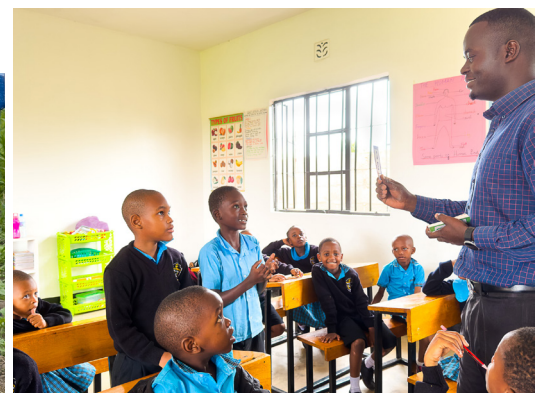
Previous RICE student now teaching at New Beginning School