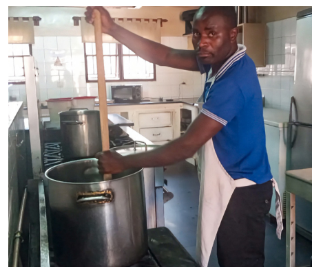
One of the cooks preparing for the evening meal. The pots for lunch are much bigger!