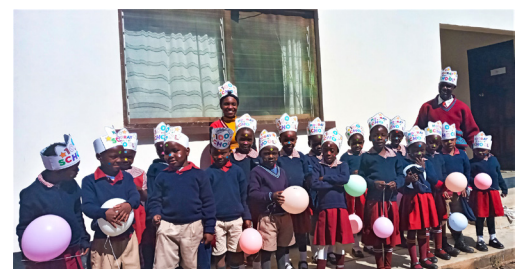
The big day