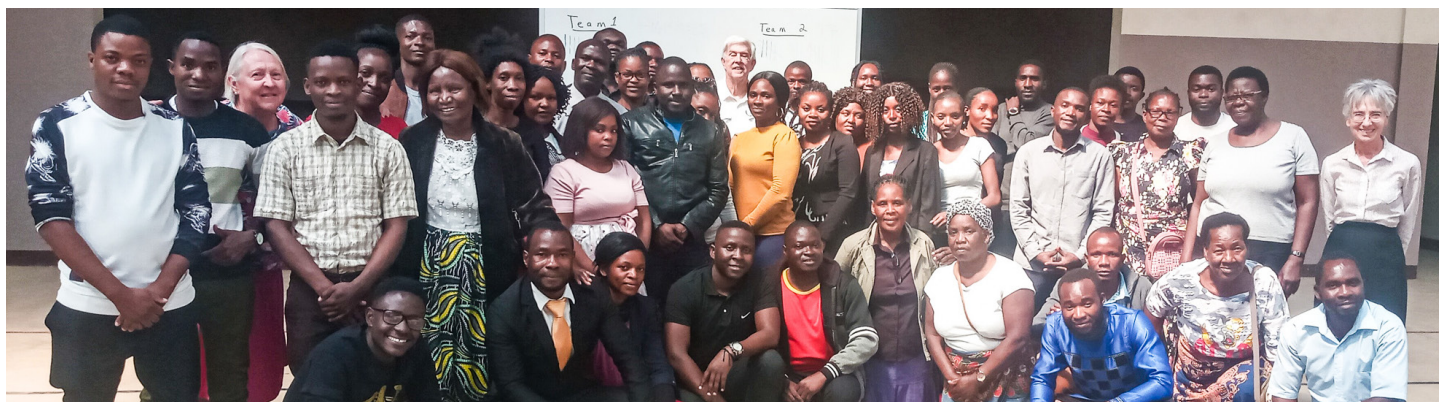
Fun for all

I end this letter as I always do: with deep gratitude for all you share with me—your financial gifts, your prayers, your encouragement. Thank you so much!